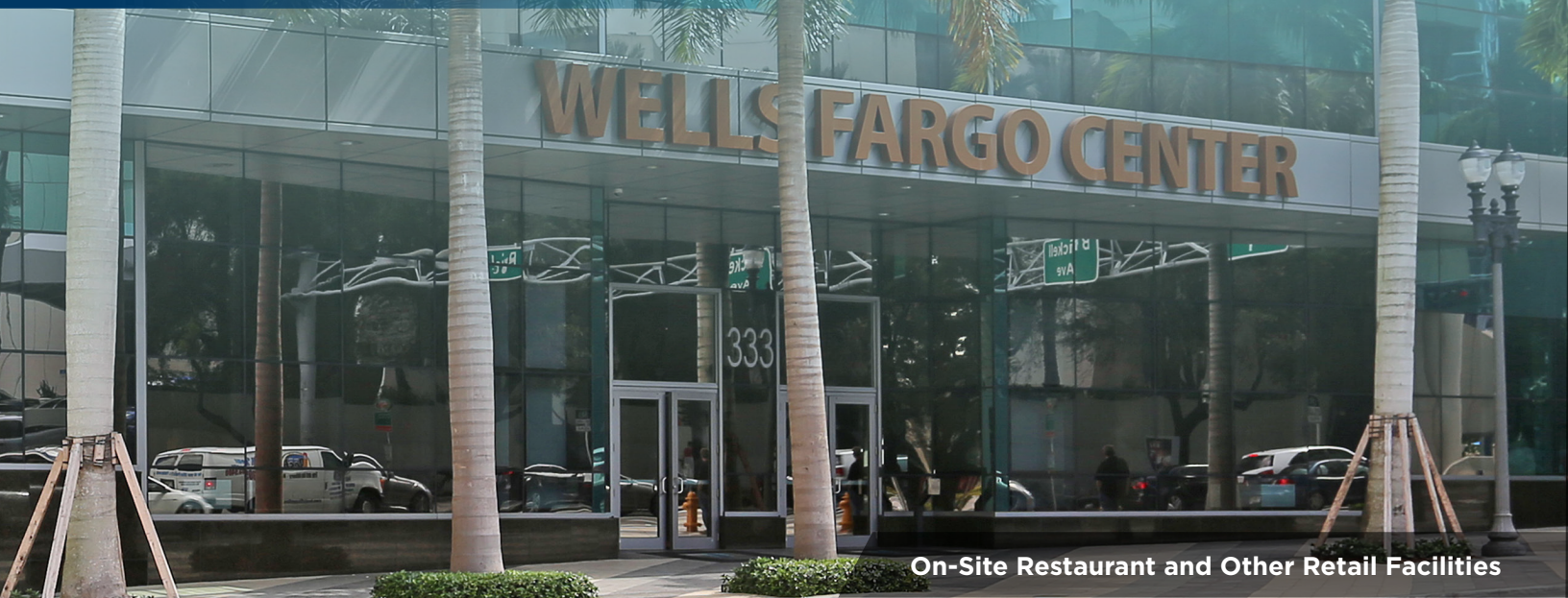
On-Site Restaurant and Other Retail Facilities